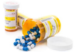
Pharmaceutical products, Body care & Medical Tests

Reduce the complexity, avoid obsolete labels, save time and money.