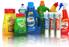
Home Care & Cleaning products