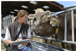
Animal Care & Veterinary products